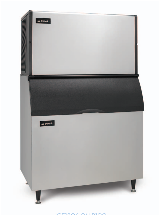
ICE1806 ON B100