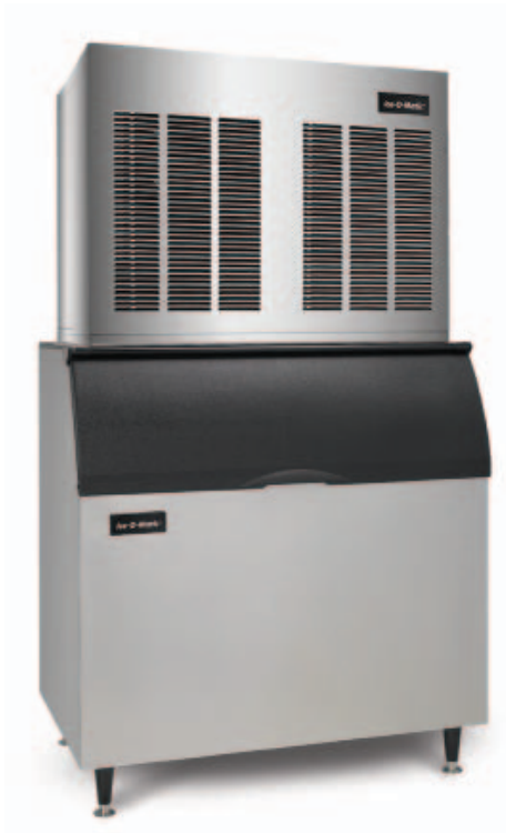
MFI2406 ON BIOO