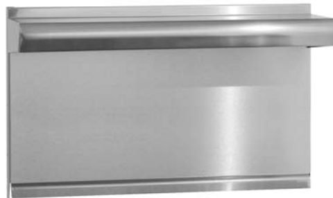
SHS series Single High Deck Shelf

Stainless steel slotted shelves are also available as an option.