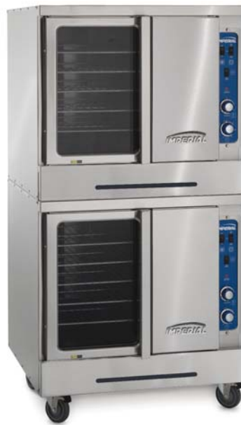
ICV-2 shown with optional casters

Four bearings per door extend the life of the door mechanism.