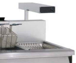
Side Car includes a stainless steel cabinet with a drain area, food warmer and dump pan.