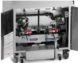
Filter is located under fryers to save valuable space.