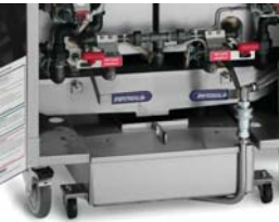
Filter pan is designed for maximum oil return.