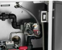
5.5 GPM, 1/3 HP roller pump speeds up filtering process.