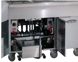
Filter is located under fryers to save valuable space.