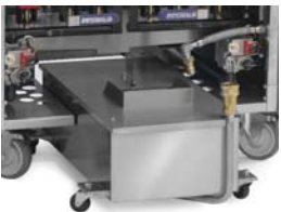
Filter pan is designed for maximum oil return.