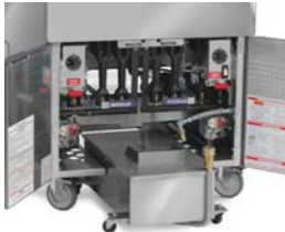
Filter is located under fryers to save valuable space.