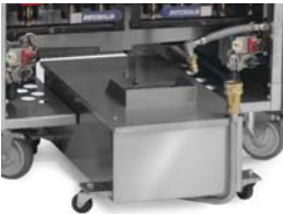
Filter pan is designed for maximum oil return.