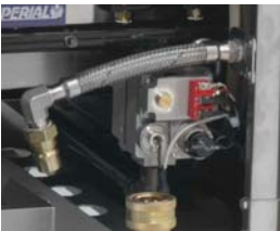
5.5 GPM, 1/3 HP roller pump speeds up filtering process.