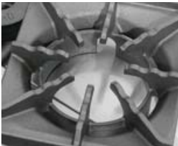
Wavy grates raise pan creating more heat transfer than direct metal-to-metal contact.