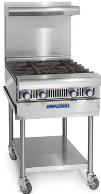
IHR-4-24-M shown with optional backguard with shelf and stainless steel stand with casters

ADD-A-UNITS - Modular/countertop (-M) styles and floor model (-XB) are available.