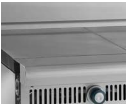
Hot Tops have even heating across surface.