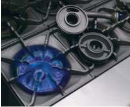
35,000 BTU/hr. (10 KW) anti-clogging, removable burner.

IHR-2-12-M IHR-2-18-M IHR-4-24-M IHR-1HT-12-M HR-1HT-18-M IHR-2HT-24-M IHR-G12-M IHR-G18-M IHR-G24-M IHR-GT12-M IHR-GT18-M IHR-GT24-M