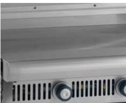
Griddle Tops have "U" shaped burners directly under plate.