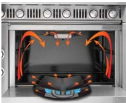
"M" shaped burner for even heating throughout the oven cavity.