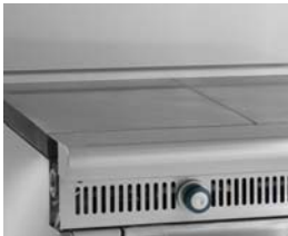
Even heating across entire Hot Top surface.