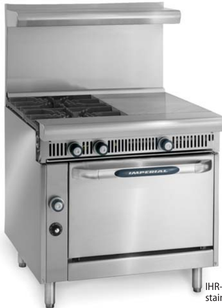
IHR-2-1HT shown with optional stainless steel backguard and shelf