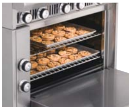
Accommodate sheet pans front-to-back and side-to-side.