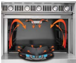
"M" shaped burner for even heating throughout the oven cavity.