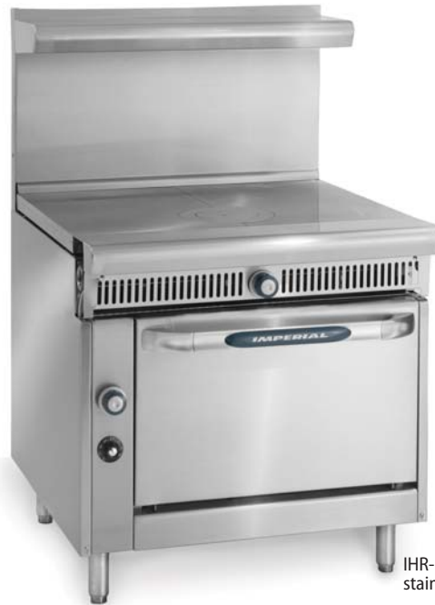
IHR-1FT shown with optional stainless steel backguard and shelf