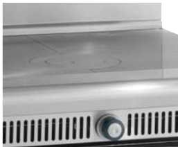
French Tops have circular cast iron ring and lift-off cover directly over burners.

IHR-2FT IHR-1FT IHR-2FT-C IHR-1FT-C IHR-2FT-XB IHR-1FT-XB IHR-2FT-M IHR-1FT-M