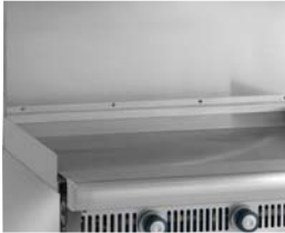
1" (25 mm) thick steel polished griddle plate.

IHR-G18-IHT IHR-GT18-IHT IHR-G18-IHT-C IHR-GT18-IHT-C IHR-G18-IHT-XB IHR-GT18-IHT-XB IHR-G18-IHT-M IHR-GT18-IHT-M