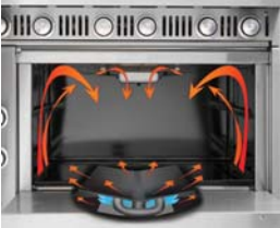
"M" shaped burner for even heating throughout the oven cavity.