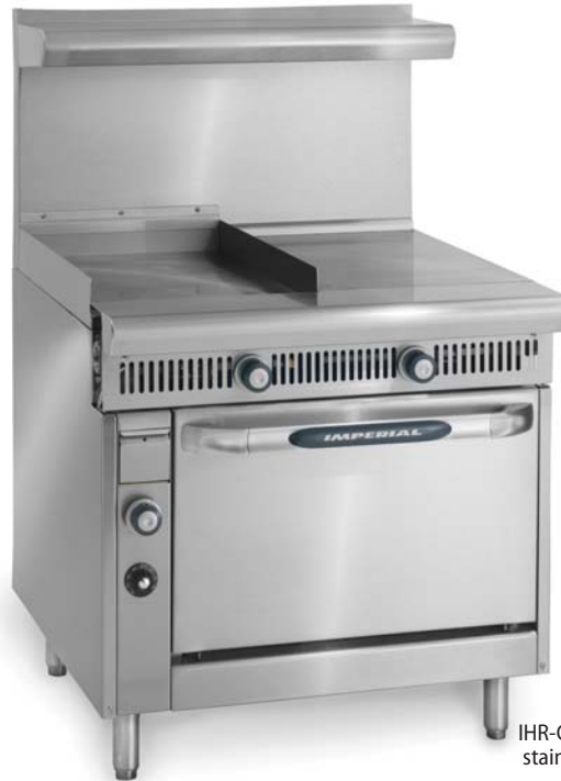
IHR-G18-1HT shown with optional stainless steel backguard and shelf

GRIDDLE TOP - Highly polished griddle plate provide even heat across entire surface.