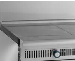
Even heating across entire Hot Top surface.