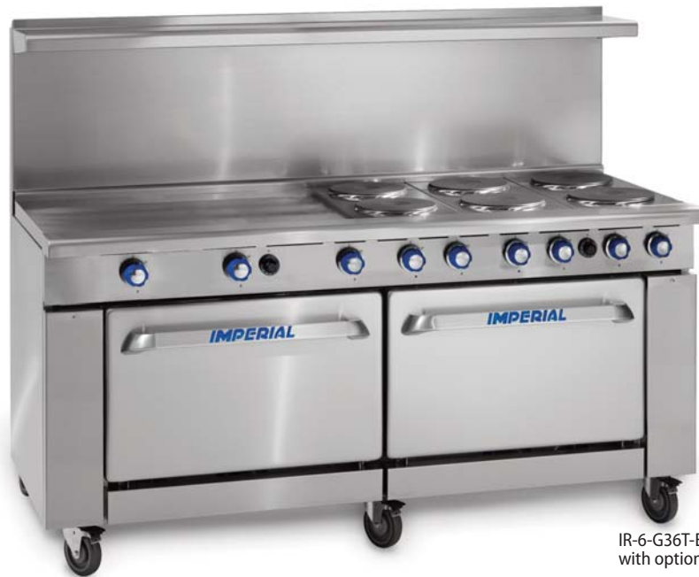
IR-6-G36T-E shown with optional casters