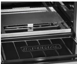
Splatter screen protects the element from spills.