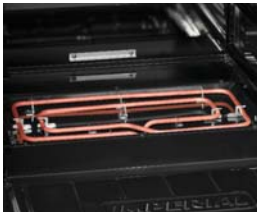
5 KW element provides even heating throughout the oven cavity.