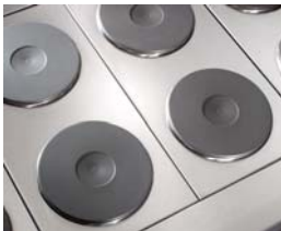
9" (229 mm) sealed round plate elements with easy to clean flat surface.