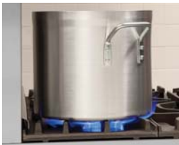
Back grate hot air dam deflects heat onto the stock pot, not the backsplash.