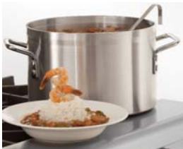
Large 5" (127 mm) stainless steel landing ledge for convenient plating.