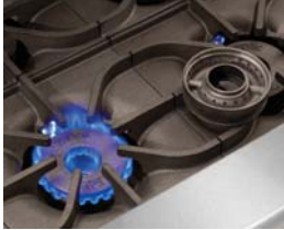
Two rings of flame for even cooking no matter the pan size.