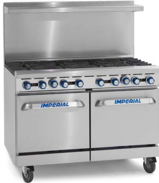
IR-8 shown with optional casters

OPEN BURNERS - PyroCentric™ 32,000 BTU (9 KW) anti-clogging burner with a 7,000 BTU/hr. (2 KW) low simmer feature. Two rings of flame for even heating.