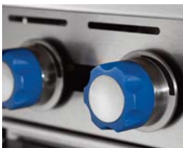
Durable cast aluminum with a yulox heat protection grip.