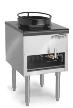
ISP-J-W13 Mandarin Wok Range