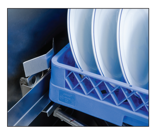
RackAware<sup>™</sup> Automatic Rack Sensing System* only runs a cycle when a rack is present