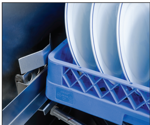
RackAware™ Automatic Rack Sensing System* only runs a cycle when a rack is present