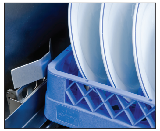
RackAware<sup>™</sup> Automatic Rack Sensing System* only runs a cycle when a rack is present