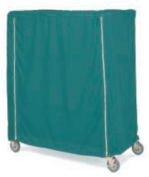
Covers entire cart/truck. Shown in Teal.

*Trademark of Herculite Protective Fabrics Corp.