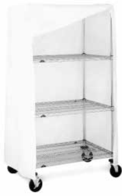
Panel folds back for easy shelf accessibility.