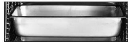
Standard Slides (Outboard)