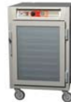
1/2 Height Clear Doors