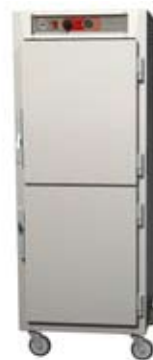
Full Height Dutch Solid Doors

Note: Add an "A" to the end of the cabinet part number when ordering accessories.