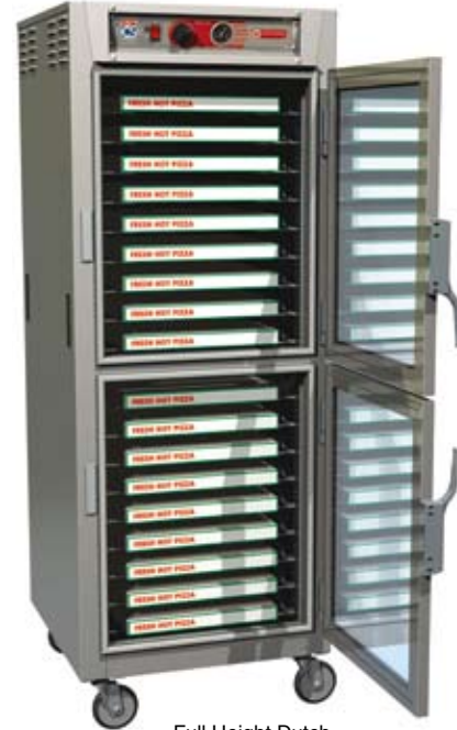
Full Height Dutch Clear Doors