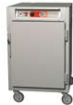
1/2 Height Solid Doors