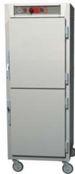
Full Height Dutch Solid Doors

Note: Add an "A" to the end of the cabinet part number when ordering accessories.