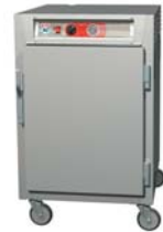
1/2 Height Solid Doors