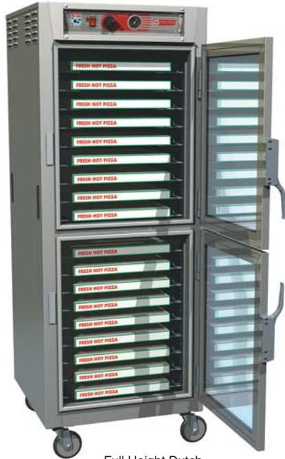
Full Height Dutch Clear Doors