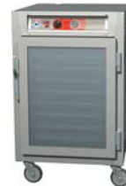
1/2 Height Clear Doors