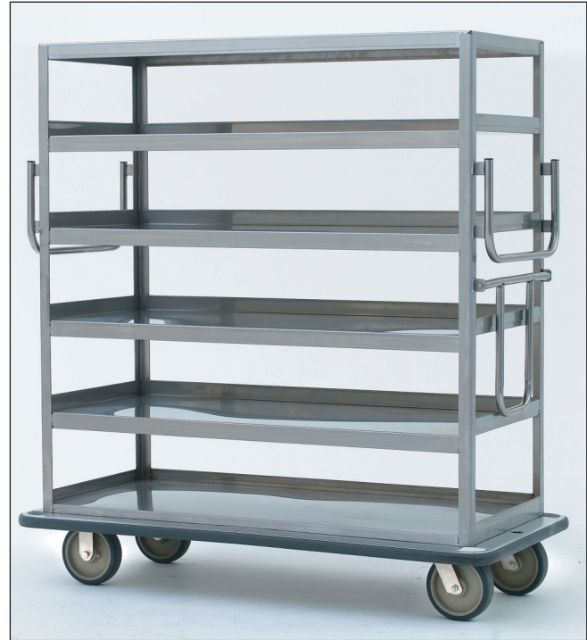
MQ-609L (Shown with optional swing-up handle)