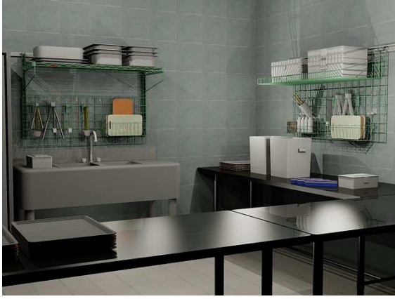
Keep prep areas organized and clean to promote a safer work environment and greater efficiencies.

A unique storage and work station system for often underutilized space – empty walls. SmartWall G3 and its system of integrated wall tracks offer the flexibility to add wall shelving and wall mounted task stations where needed throughout a facility. The use of the system around and above sinks, work tables, and equipment will keep these areas cleaner and more organized. SmartWall G3 can become an integral part of everyday operating processes to improve efficiencies and ultimately the return on investment (ROI).