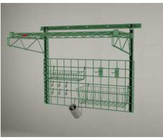
Task station (medium duty) configuration with accessories for a prep / wash sink.