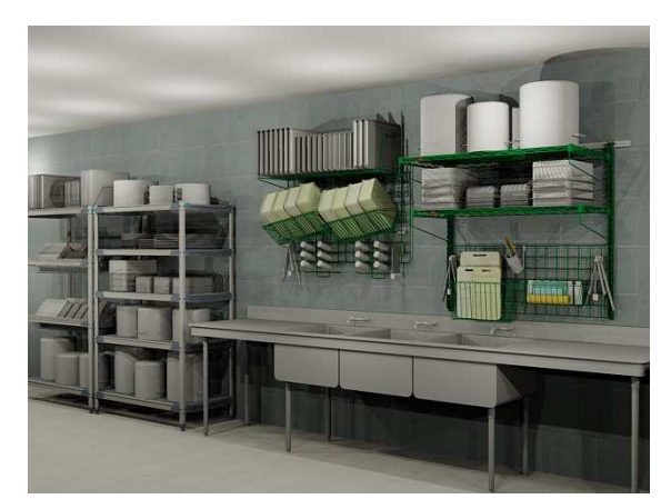
Safely air dry and organize containers, cutting boards, trays, and utensils.