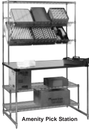
Amenity Pick Station

Equip and organize the housekeeping cart prep area with Storage/Pick stations and high-density Tote Storage Cart.