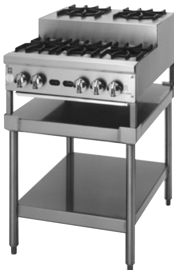
JHPE-218 shown with ST-24