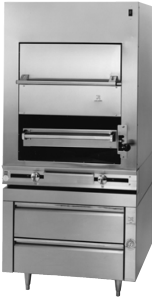
JMHB-36 shown with JRLH-02R-T-36