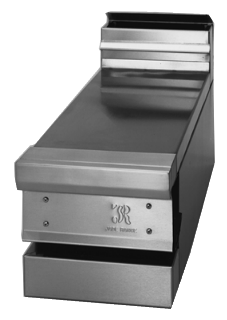
JMPR-12 (shown without legs)