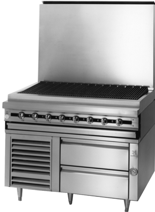
JMRH-48B shown with high back riser and JRLH-02S-T-48