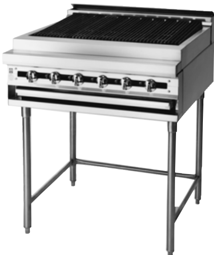
JMRH-36 Shown with floor length legs