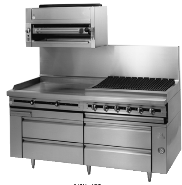
JMRH-36GT with range match broiler, remote refrigerator base, and range mount salamander