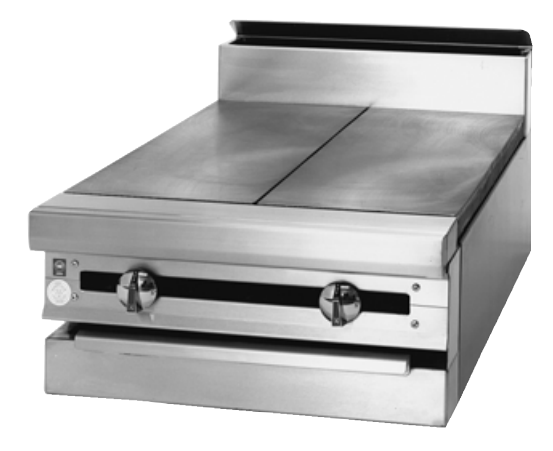
JMRH-2HT-A (shown without legs)