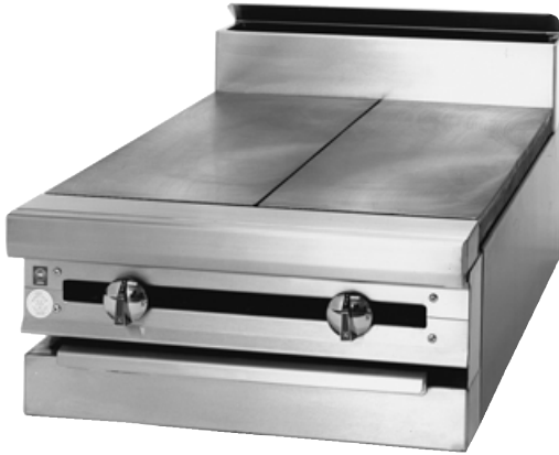
JMRH-2HT-A (shown without legs)