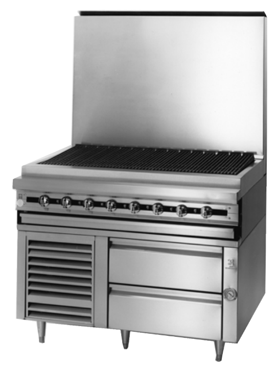
JMRH-48B shown with high back riser and JRLH-02S-T-48