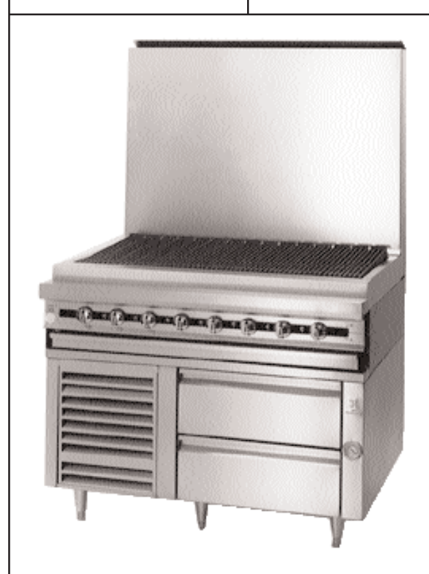
JRLH-02S-T-48 shown with JMRH-48B