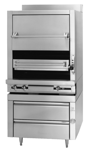
JMHBR-36H with JRLH-02R-T-36