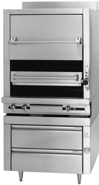
JMHR-36H with JRLH-02R-T-36