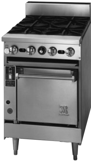
JSR-4-22C with optional stub back