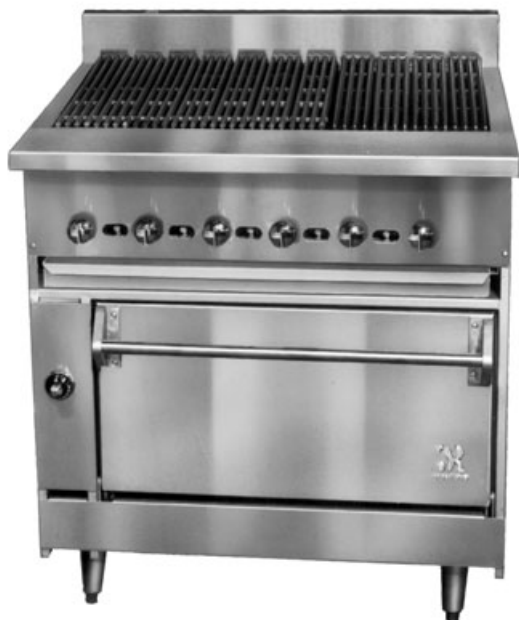
JSR-36B-36 with optional stub back