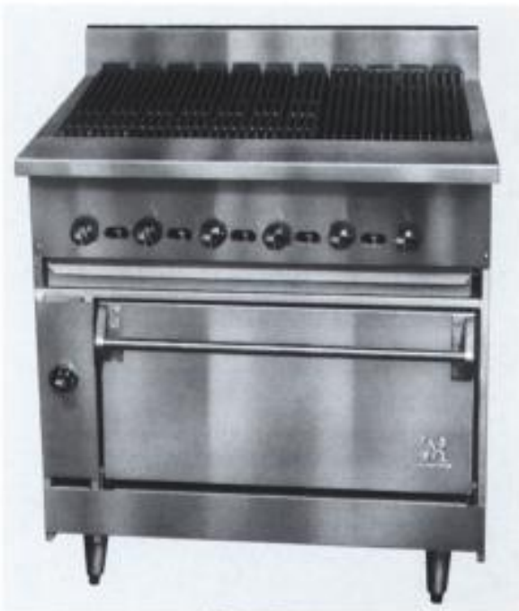
JSR-36B-36 With Optional Stub Back