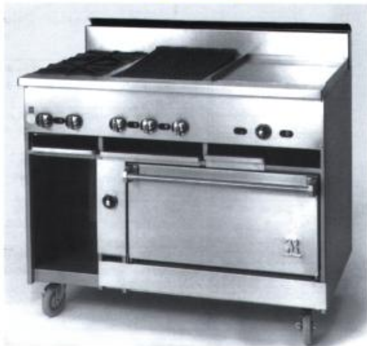
JSR-2-18B-18GT-36 With Optional Stub Back And Casters