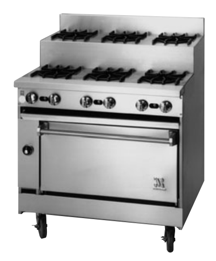
JSRE-3-3-36 with optional casters.