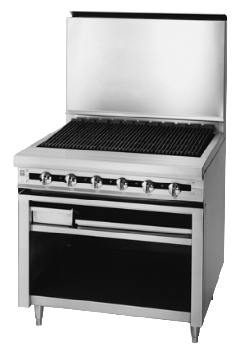
JTRH-36B shown with optional high riser