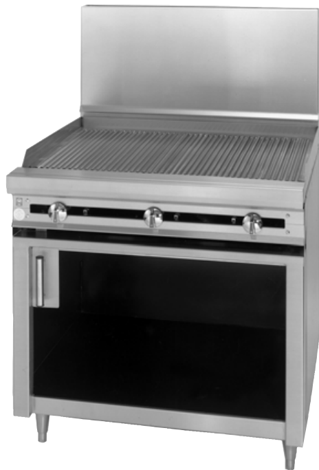
JTRH-36GG with stainless steel riser