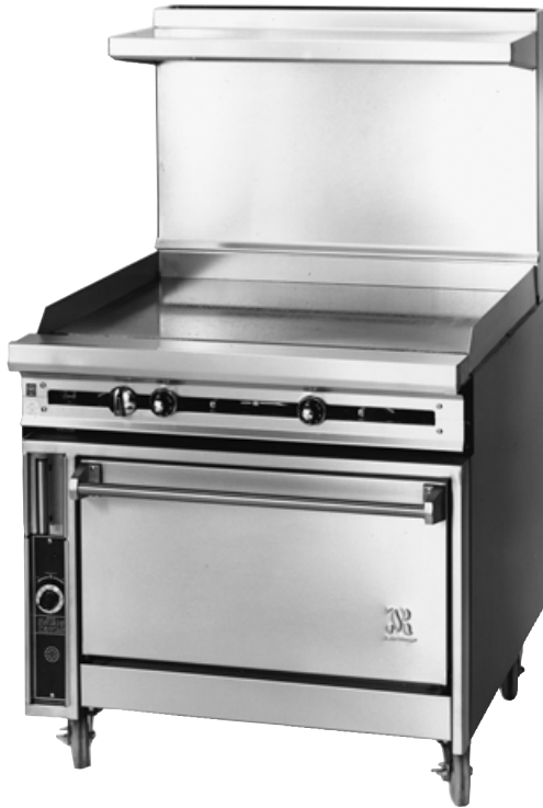
JTRH-36GT-36 with optional high shelf and casters