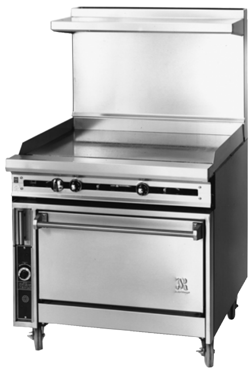
JTRH-36GT-36 with optional high shelf and casters