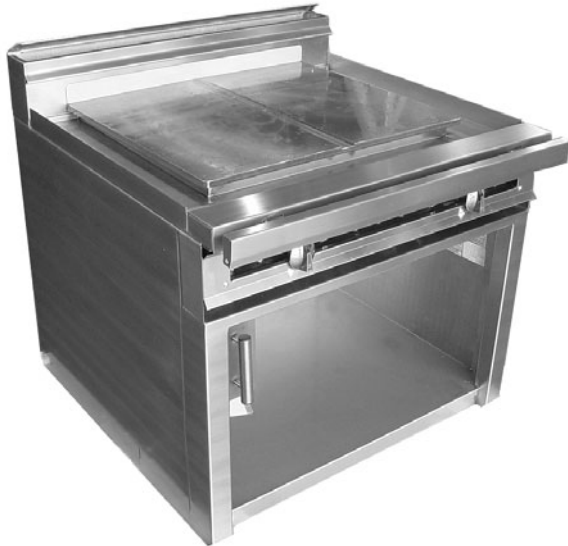
JTRH-36P (shown w/ cabinet base)