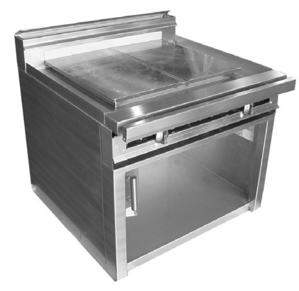
JTRH-36P (shown w/ cabinet base)