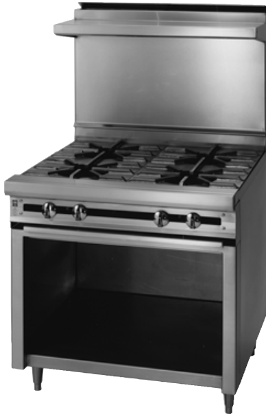
JTRH-4 with optional high shelf

TITAN CABINET BASE OPEN BURNER RANGE (18" SECTIONS)