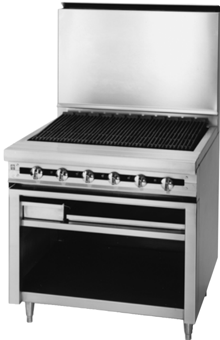
JTRH-36B shown with optional high riser