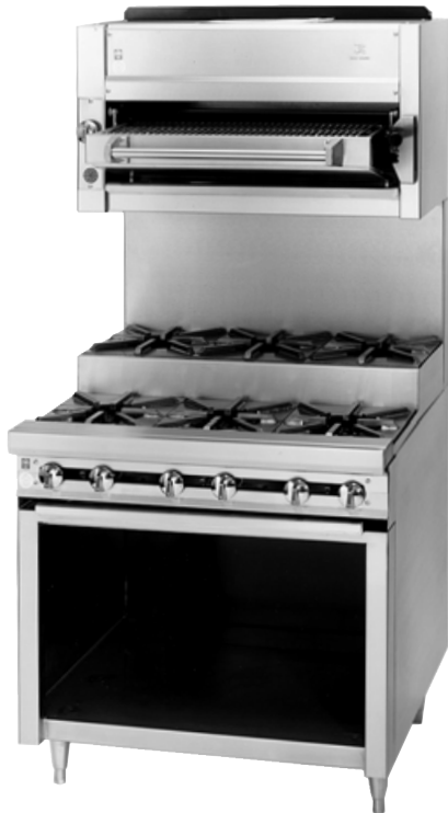
JTRHE-3-3 with JSB-36RM range mounted salamander