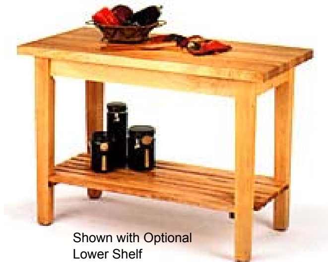
Shown with Optional Lower Shelf