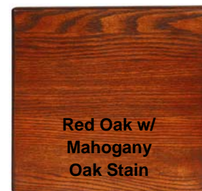
Red Oak w/ Mahogany Oak Stain