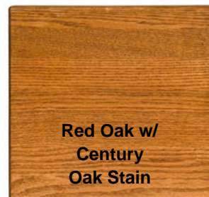
Red Oak w/ Century Oak Stain