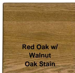
Red Oak w/ Walnut Oak Stain