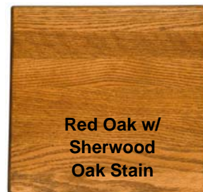
Red Oak w/ Sherwood Oak Stain